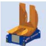
Plate from polyurethane can be slid onto the table surface by rails. Can be combined freely. Can be exchanged or retrofitted later.